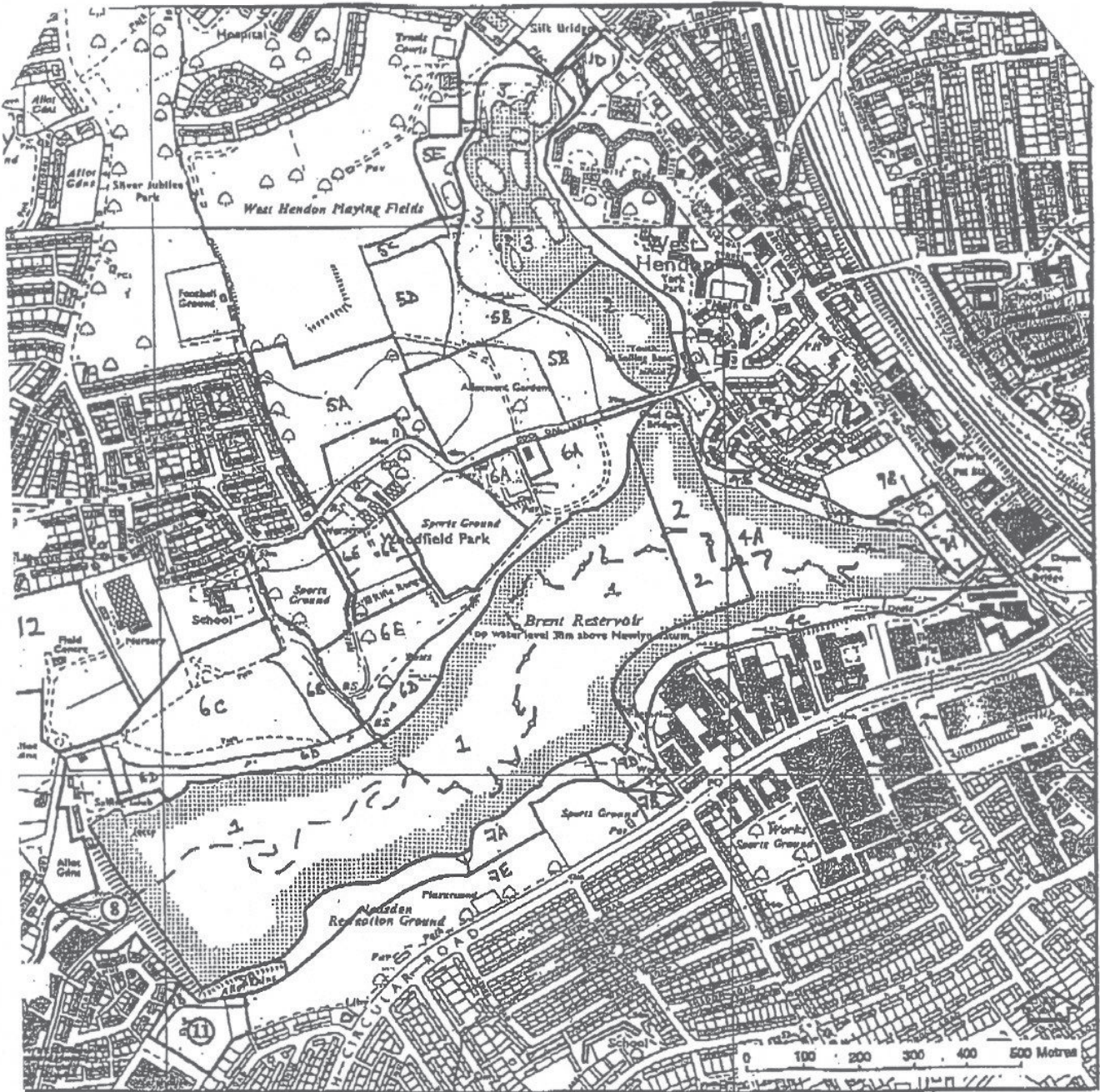
Welsh Harp Reservoir: Management Plan Zones Map